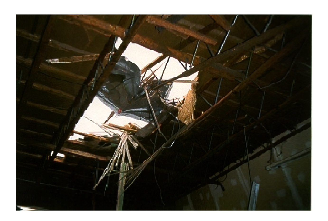
Photograph #2 – Shows damaged roof and cab of tank truck lodged in the ceiling.

A-1 Swab Ltd. File: F-396890 Attachment B Page 2 of 7