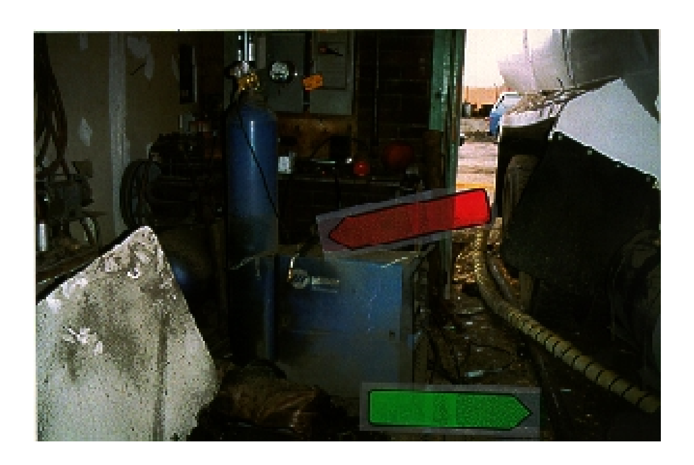
Photograph #7 – Shows the wire feed welder's position with respect to the tank truck. Green arrow [lower arrow] shows the overflow pipe location. Red arrow [upper arrow] shows the welding stinger used to strike the arc.

A-1 Swab Ltd. File: F-396890 Attachment B Page 7 of 7