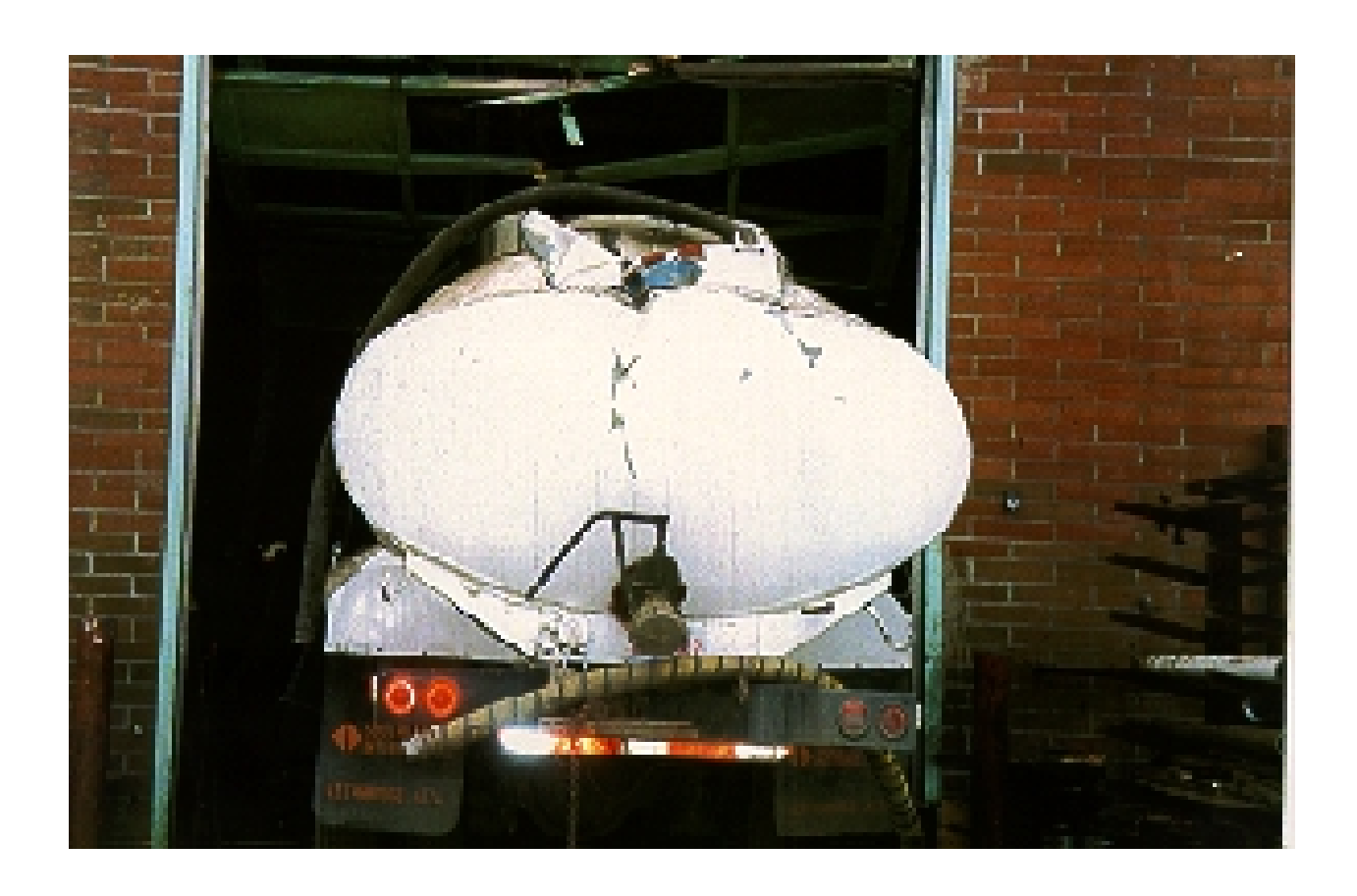
\label{eq:Photograph #3-Shows the damaged tank truck from the rear.}

A-1 Swab Ltd. File: F-396890 Attachment B Page 3 of 7