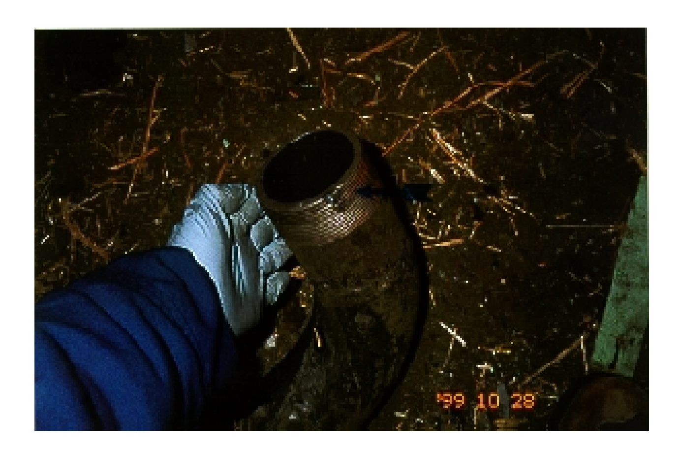
Photograph #5 – Shows overflow pipe elbow. Arrow shows where a welding arc had been struck.

A-1 Swab Ltd. File: F-396890 Attachment B Page 5 of 7