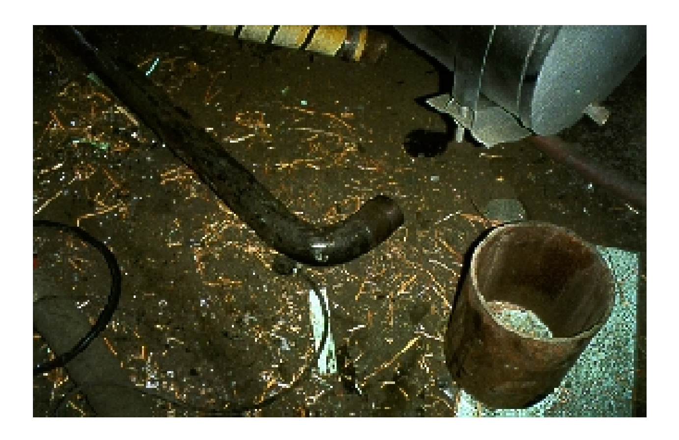
Photograph #6 – Shows the overflow pipe situated on the shop floor.

A-1 Swab Ltd. File: F-396890 Attachment B Page 6 of 7