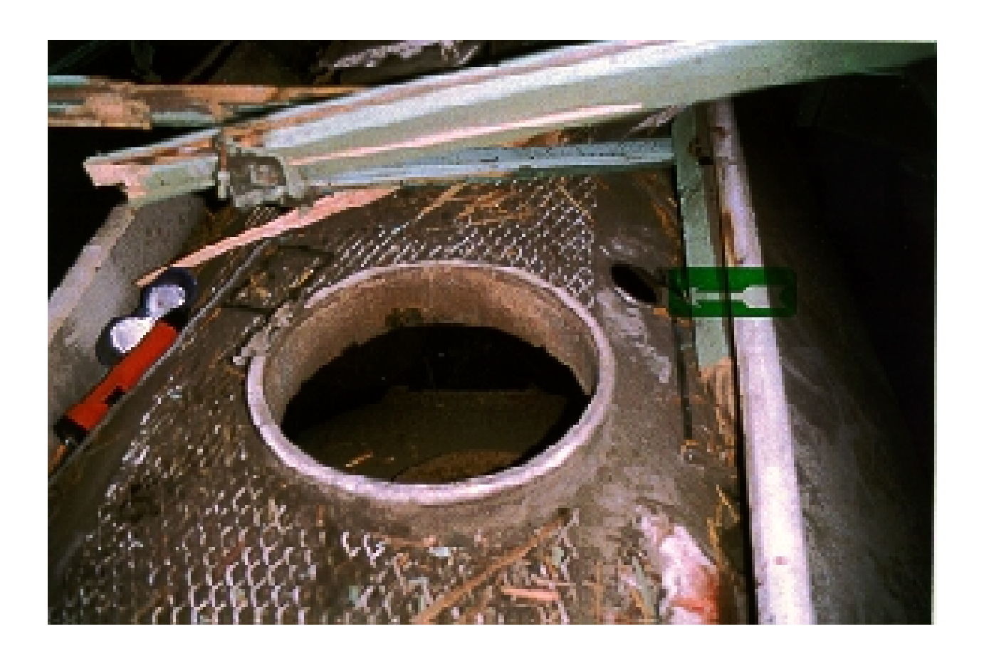
Photograph #4 – - Arrow shows the opening where the overflow pipe was to be welded.

A-1 Swab Ltd. File: F-396890 Attachment B Page 4 of 7